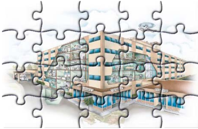
HAH Hospital Network Concept

HAH network of hospitals and affiliated health care organizations mobilize as a integrated system to implement a coordinated, statewide response: