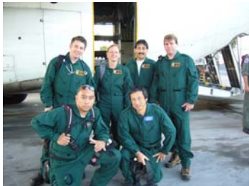
Hawaii DMAT Strike Team at Operation Lightning Rescue exercise - September 2006

10-Person Medical Strike Teams of the Hawaii DMAT 1 can be deployed to assess and augment on-scene emergency care at a Mass Casualty Incident (MCI), to conduct specialized Aero-medical Evacuation (AE), serve as the advance party to a main body DMAT deployment, or to establish an HAH Acute Care Module: